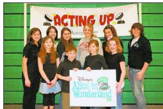
PROVIDED. SUBMIT PHOTOS TO: RMALONEY@COMMUNITYPRES